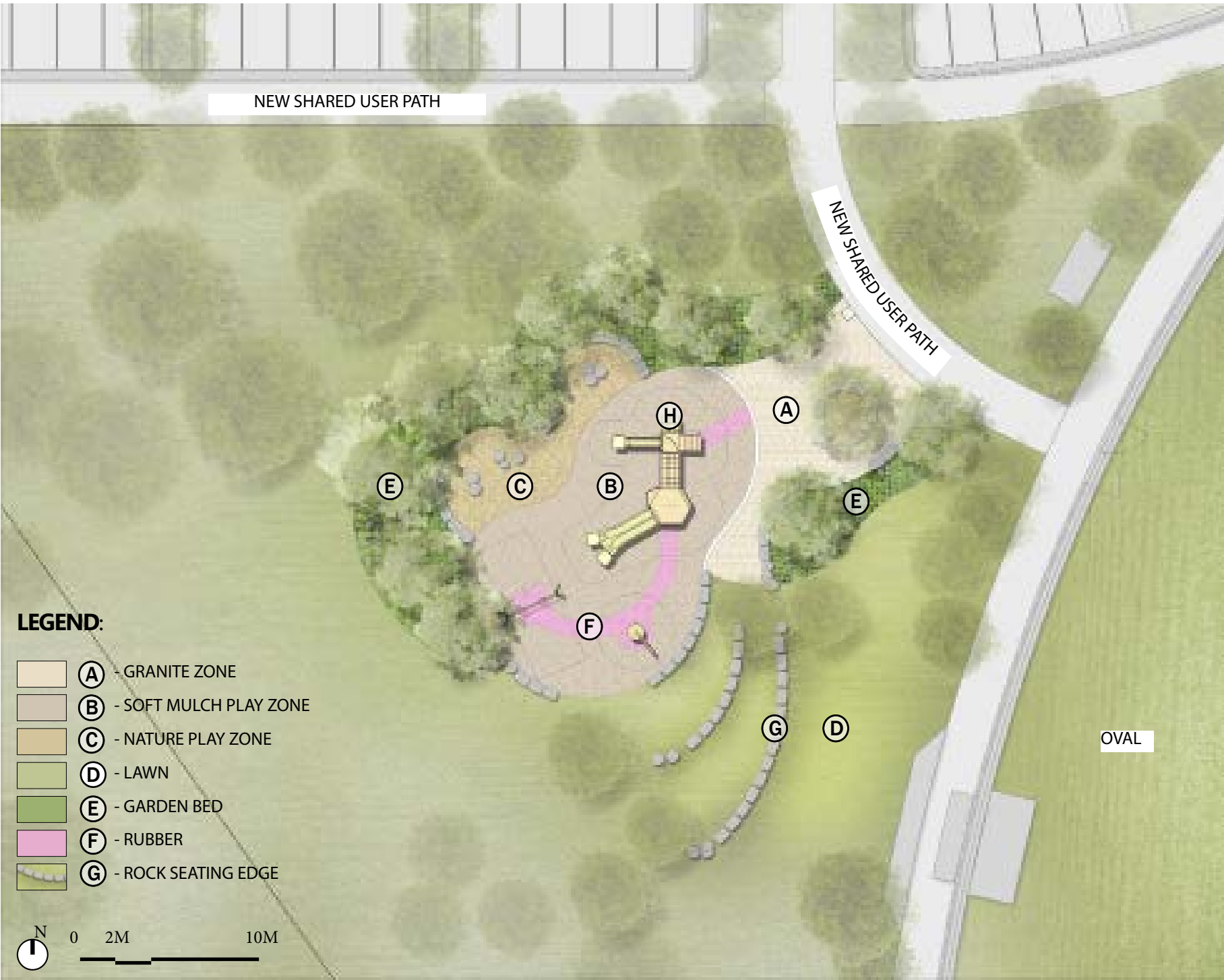
PROPOSED PLAYSPACE CONCEPT PLAN