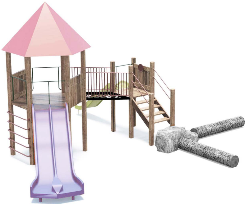
PROPOSED ROCK SEATING TERRACE & NATURE PLAY SPACE