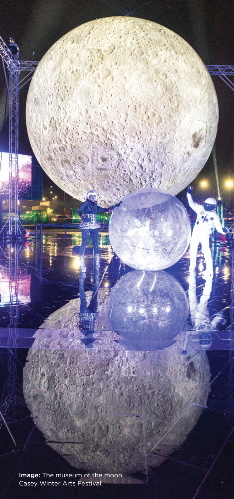
Image: The museum of the moon, Casey Winter Arts Festival.