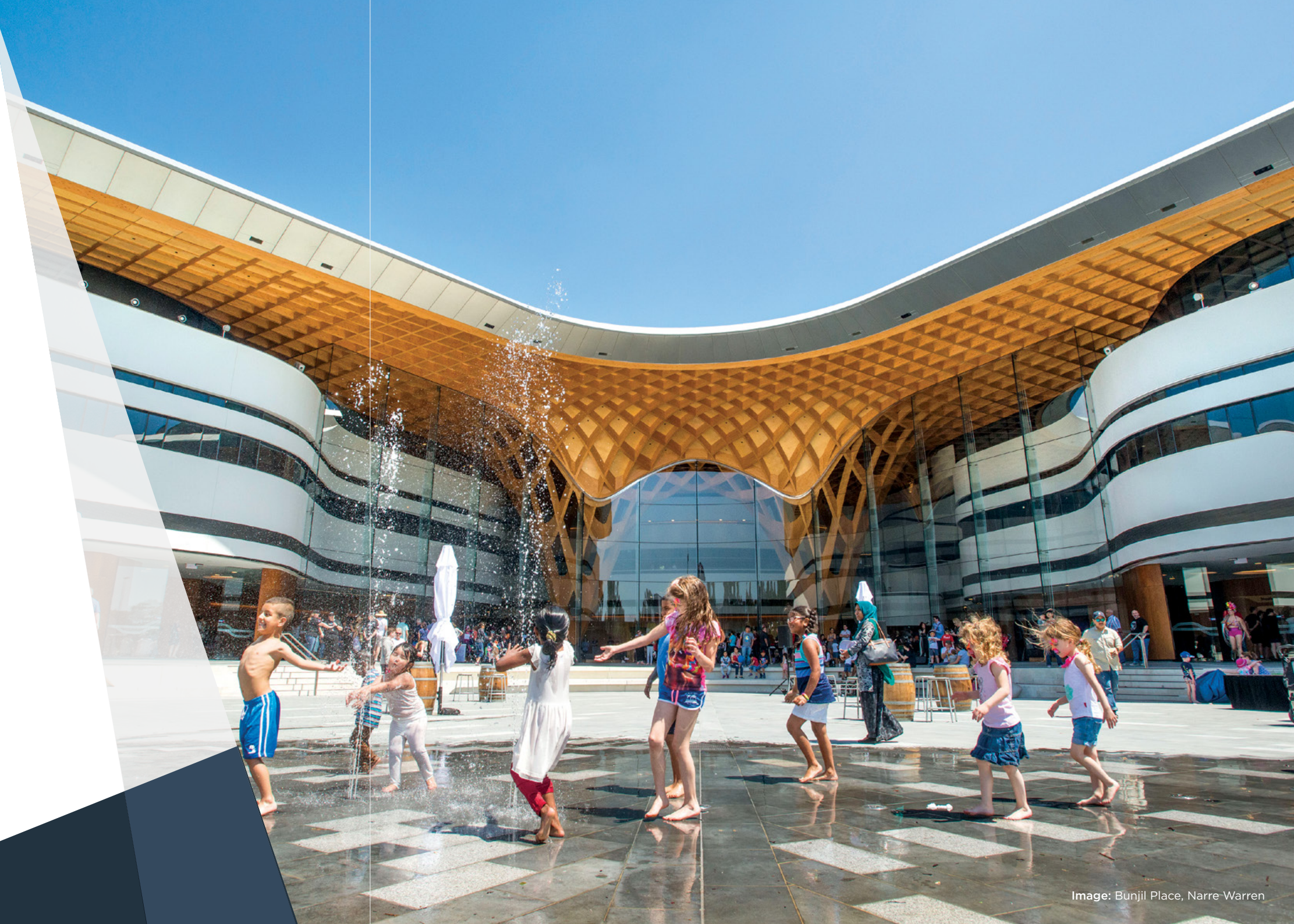
Image: Bunjil Place, Narre Warren

Design Casey as a highly liveable city where people can enjoy their best life.