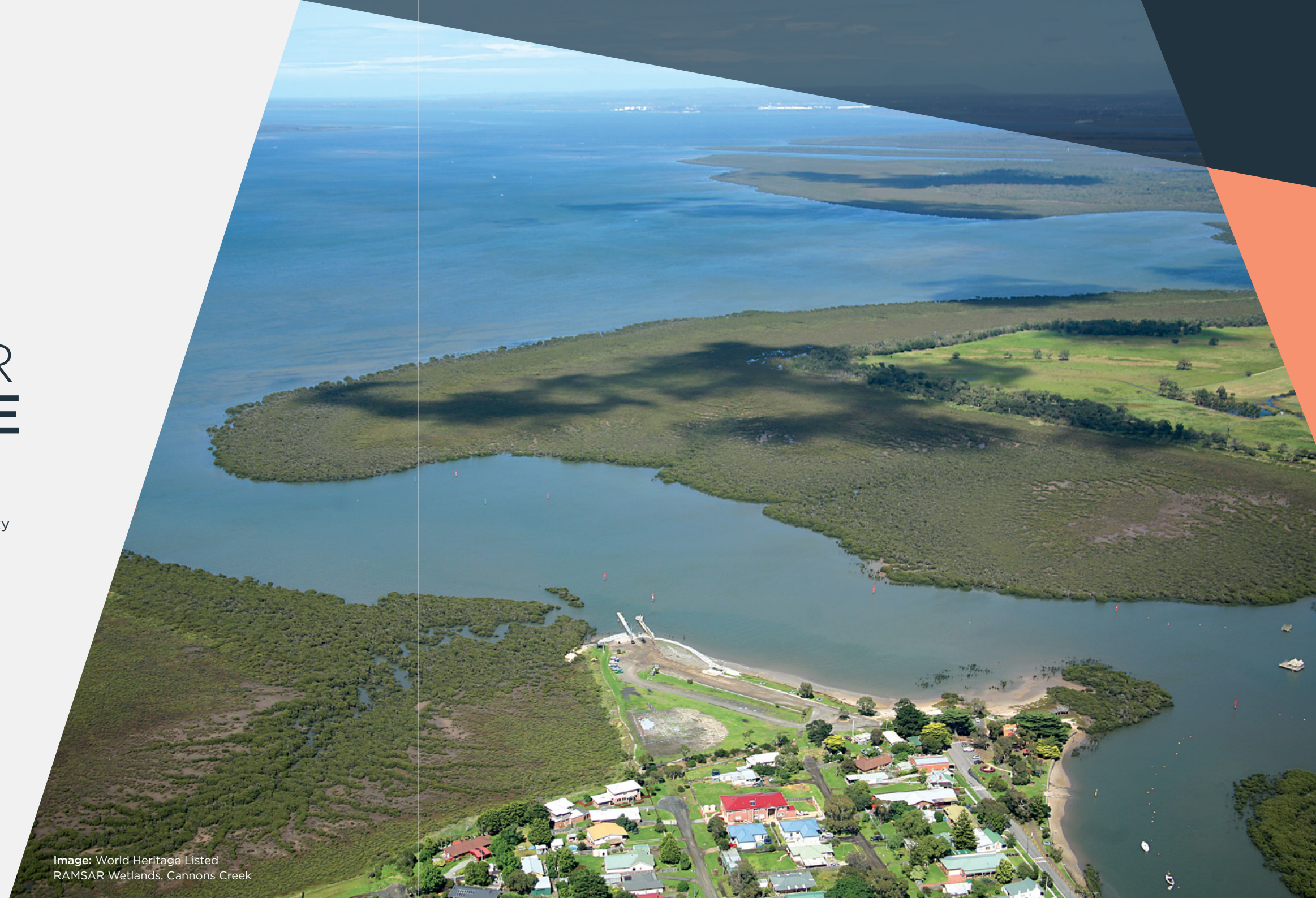
Image: World Heritage Listed RAMSAR Wetlands, Cannons Creek

Design the city so that it is innovative and resilient to the changes the future will bring. Build into the urban environment adaptability to new conditions, including climate change.