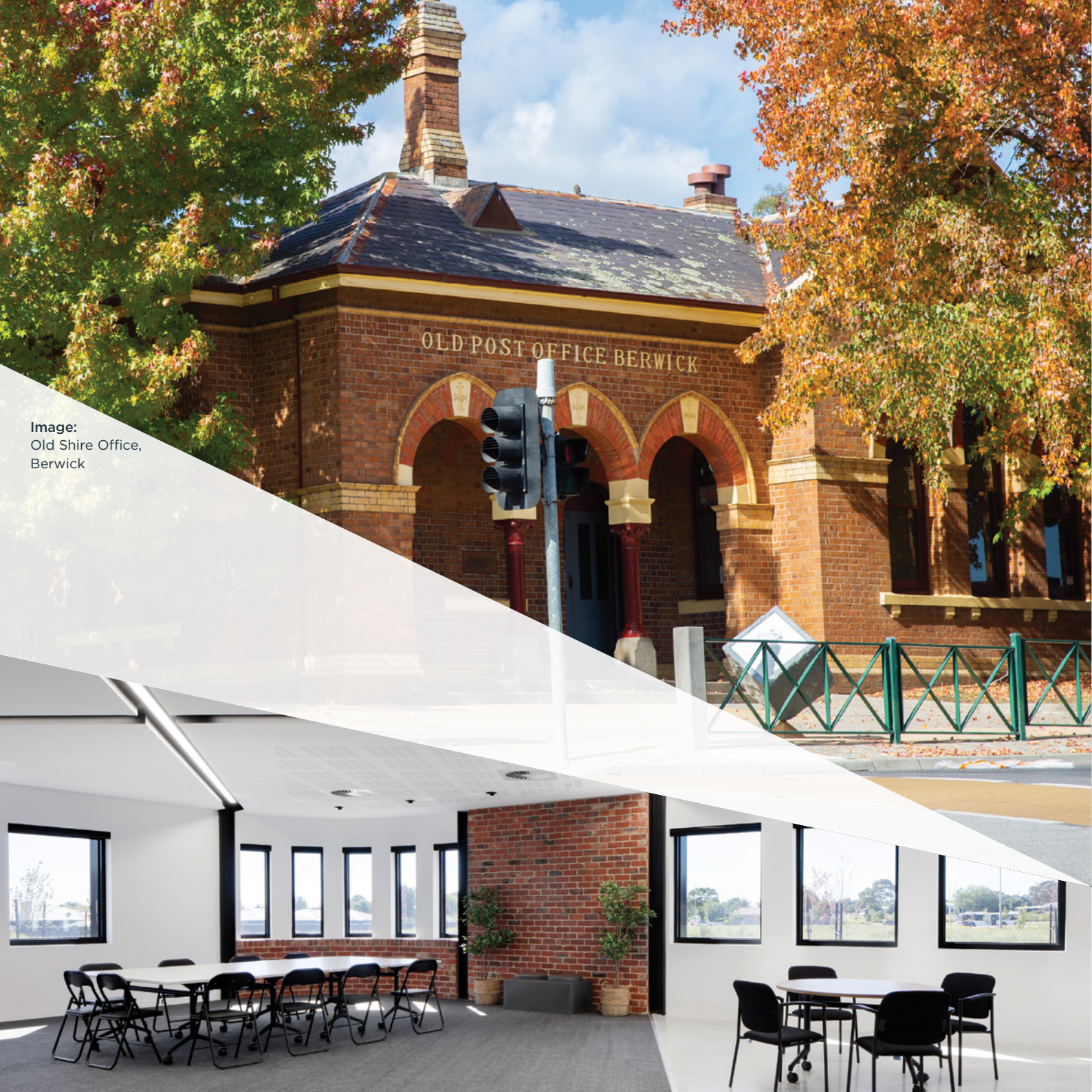
Image: Old Shire Office, Berwick