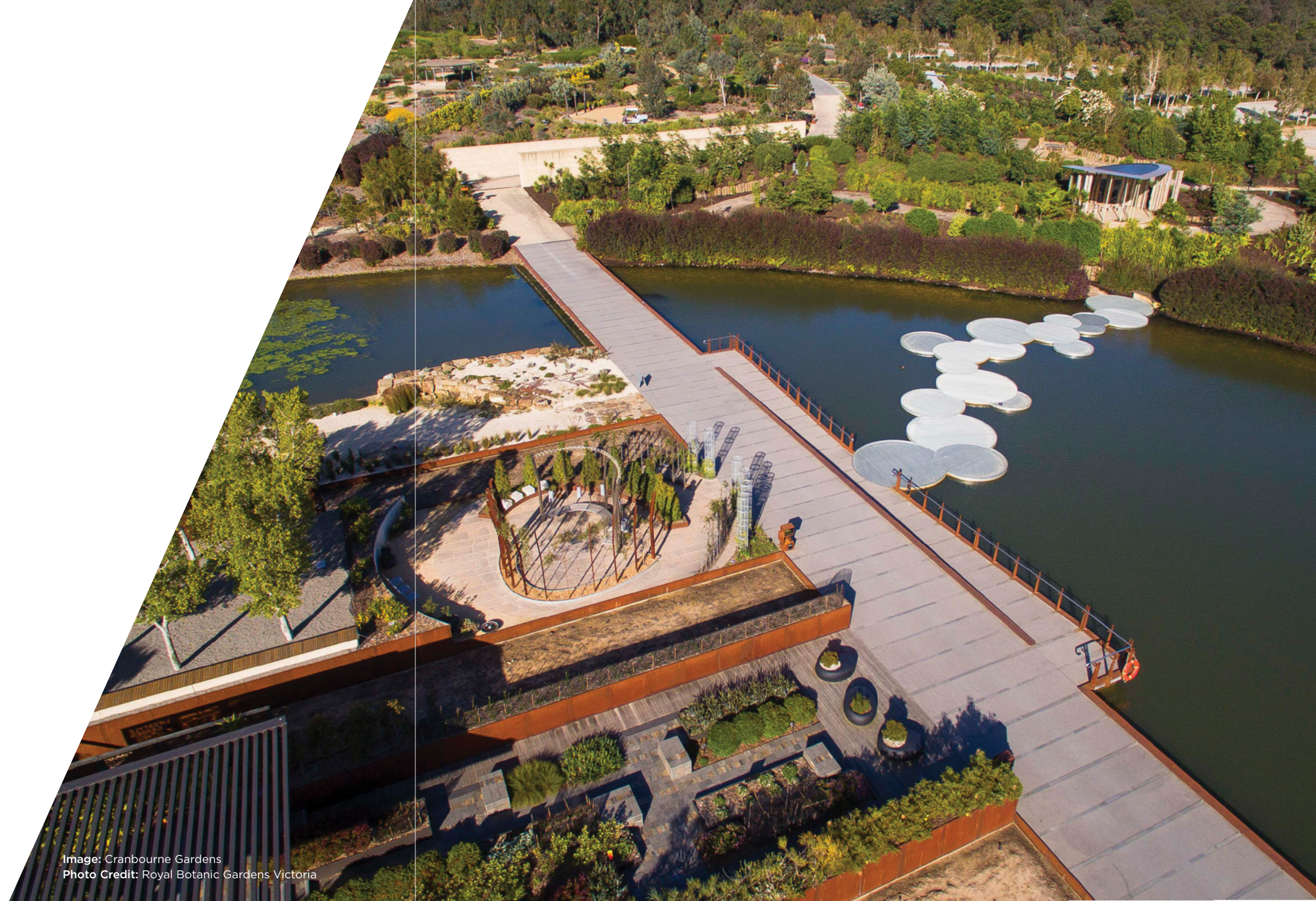
Image: Cranbourne Gardens

Create a culture of design excellence that empowers our people to deliver – consistently, and over the long-term – design that is innovative, inspired by best practice and that incrementally shapes Casey as a world leading Design City .