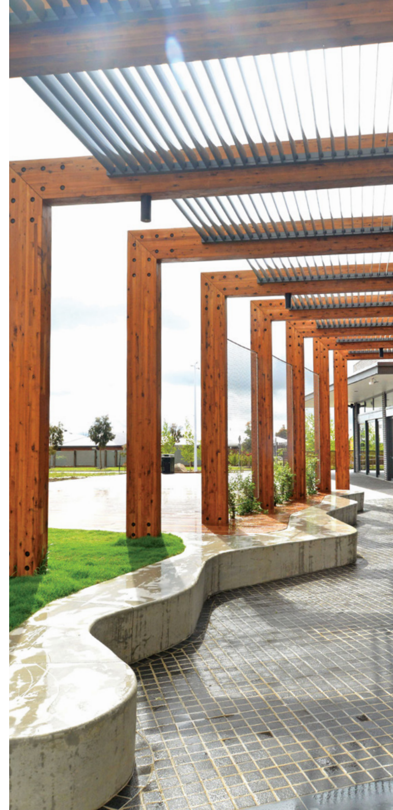
Image: Selandra Community Hub, Clyde North