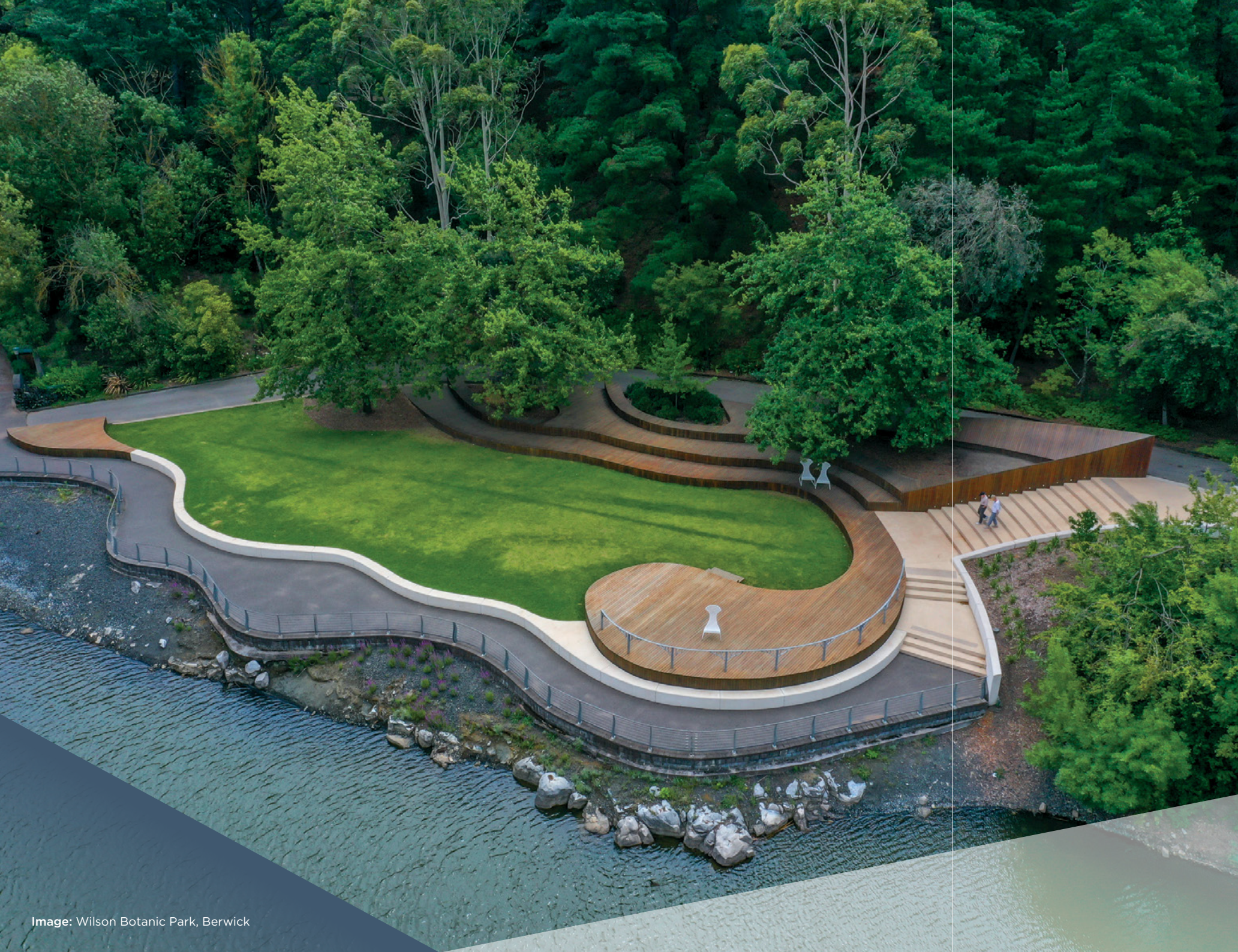
Image: Wilson Botanic Park, Berwick