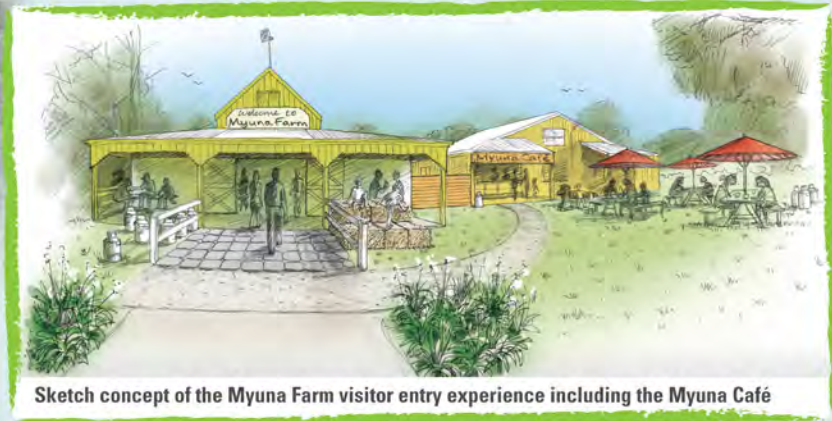
Sketch concept of the Myuna Farm visitor entry experience including the Myuna Café