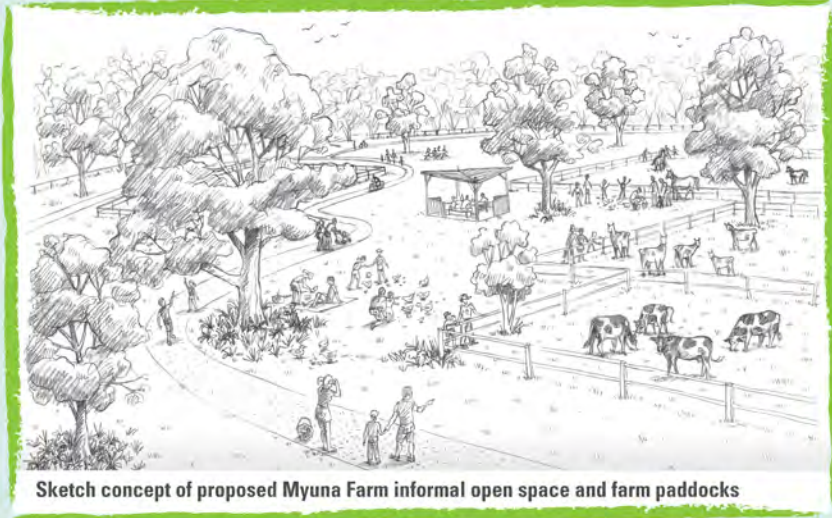
Sketch concept of proposed Myuna Farm informal open space and farm paddocks